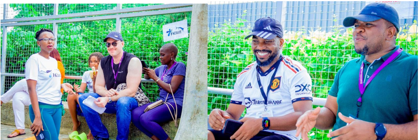
The Blue marlins supporters at the 16 th Tanzania National Club Championship